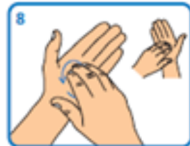
8 Rub tips of fingers in opposite palm in a circular motion