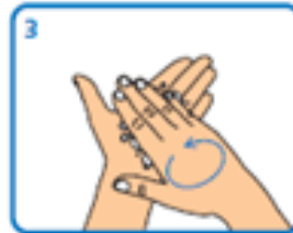
3 Rub hands palm to palm