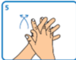
5 Rub palm to palm with fingers interlaced