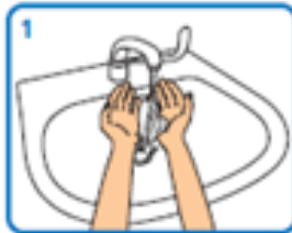
1 Wet hands with water