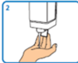
2 Apply enough soap to cover all hand surfaces