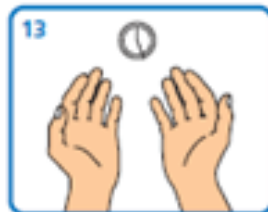
13 Hand washing should take 15-30 seconds