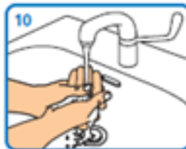
10 Rinse hands with water