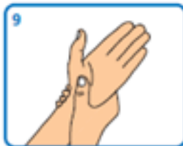
9 Rub each wrist with opposite hand