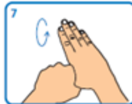
7 Rub each thumb clasped in opposite hand using a rotational movement