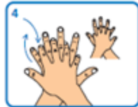
4 Rub back of each hand with palm of other hand with fingers interlaced