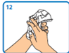
12 Dry thoroughly with a single-use towel